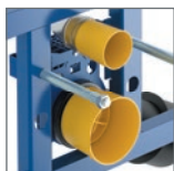
SupraFix 3.0 Villeroy & Boch