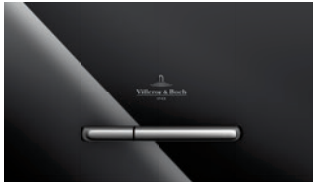
Art.-Nr.: 922160-xx Material: Glass

COLOUR VARIATIONS (FLUSH PLATE/PUSH BUTTONS)