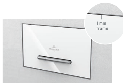
Flush-mounted with a stainless steel frame (1 mm) 922159LC installation set flush-mounted