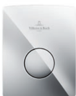
Art.-Nr.: 921944-xx Material: Plastics

The 3 urinal flush plates blend perfectly with any bathroom style thanks to their sleek design and when combined with the toilet flush plate they give the bathroom a very attractive overall impression.