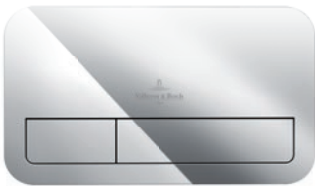
Art.-Nr.: 922490-xx Material: Plastics

The modern E200 flush plate features sleek lines and a timeless design.