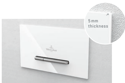
Surface-mounted (no additional parts required)

The stainless steel installation set allows the flush plates in the M300 and E300 series to be surface-mounted as well as flush-mounted.