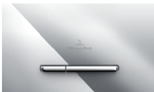
Art.-Nr.: 9221xx-xx Material: Plastics

COLOUR VARIATIONS (FLUSH PLATE/PUSH BUTTONS)