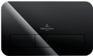
Art.-Nr.: 921843-RB Material: Glass & LED

Lighting centrepiece for the bathroom. The flush plate has been finished with an illuminated border, turning it into a true centrepiece in the bathroom. The subtle LED light creates a pleasant atmosphere and functions as a nightlight.