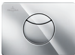
Art.-Nr.: 922485-xx Material: Plastics/Stainless Steel

The E100 model has an impressively large round push surface and a very simple operation.