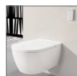
ViClean Villeroy & Boch