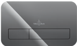
Art.-Nr.: 922400-xx Material: Glass

The glass surface of the M200 flush plate makes the toilet area look extremely elegant.