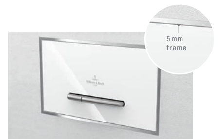
If required: 922158LC distance frame (5 mm) for covering uneven tile joints